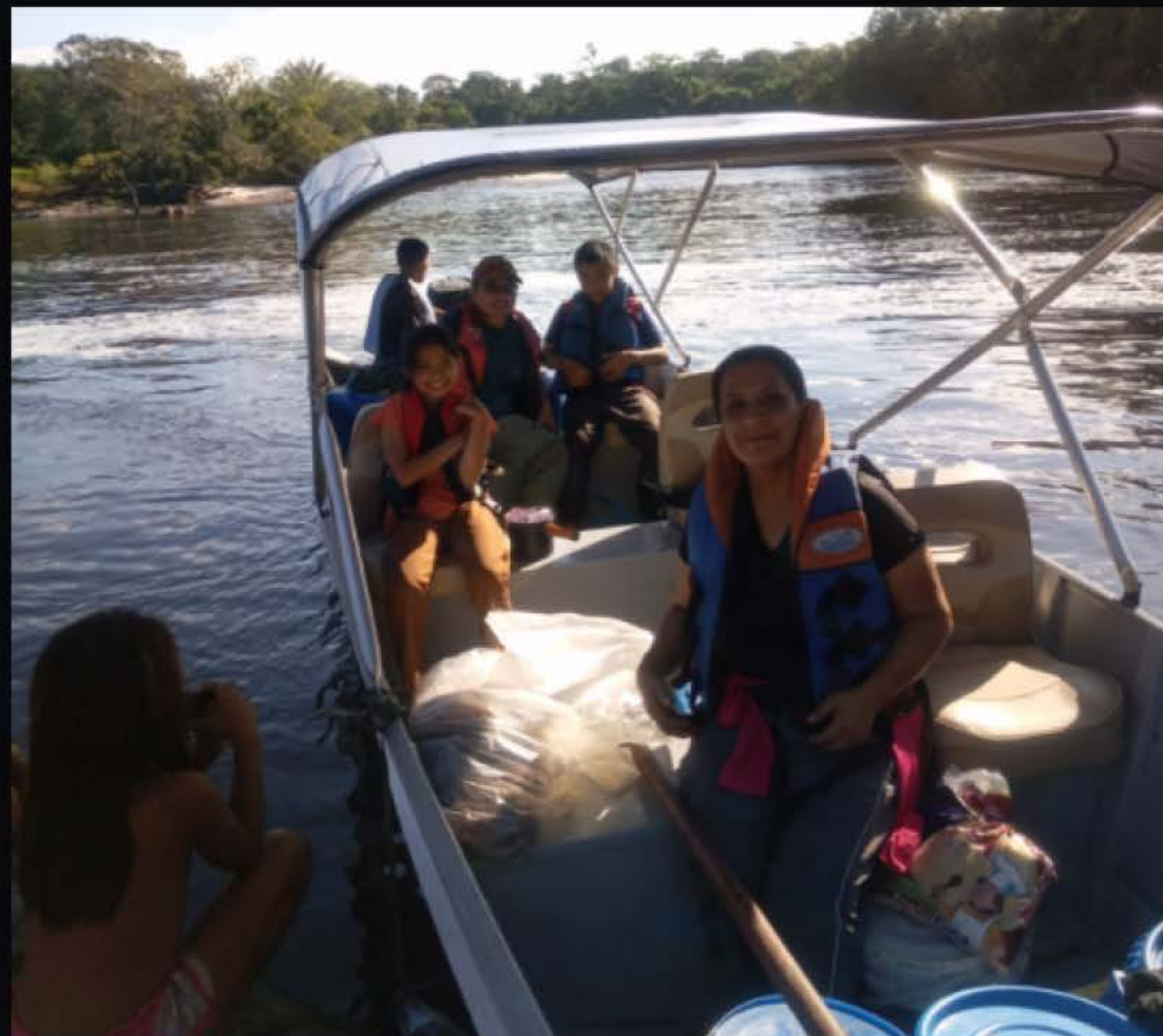
RIVER BOAT Brazil