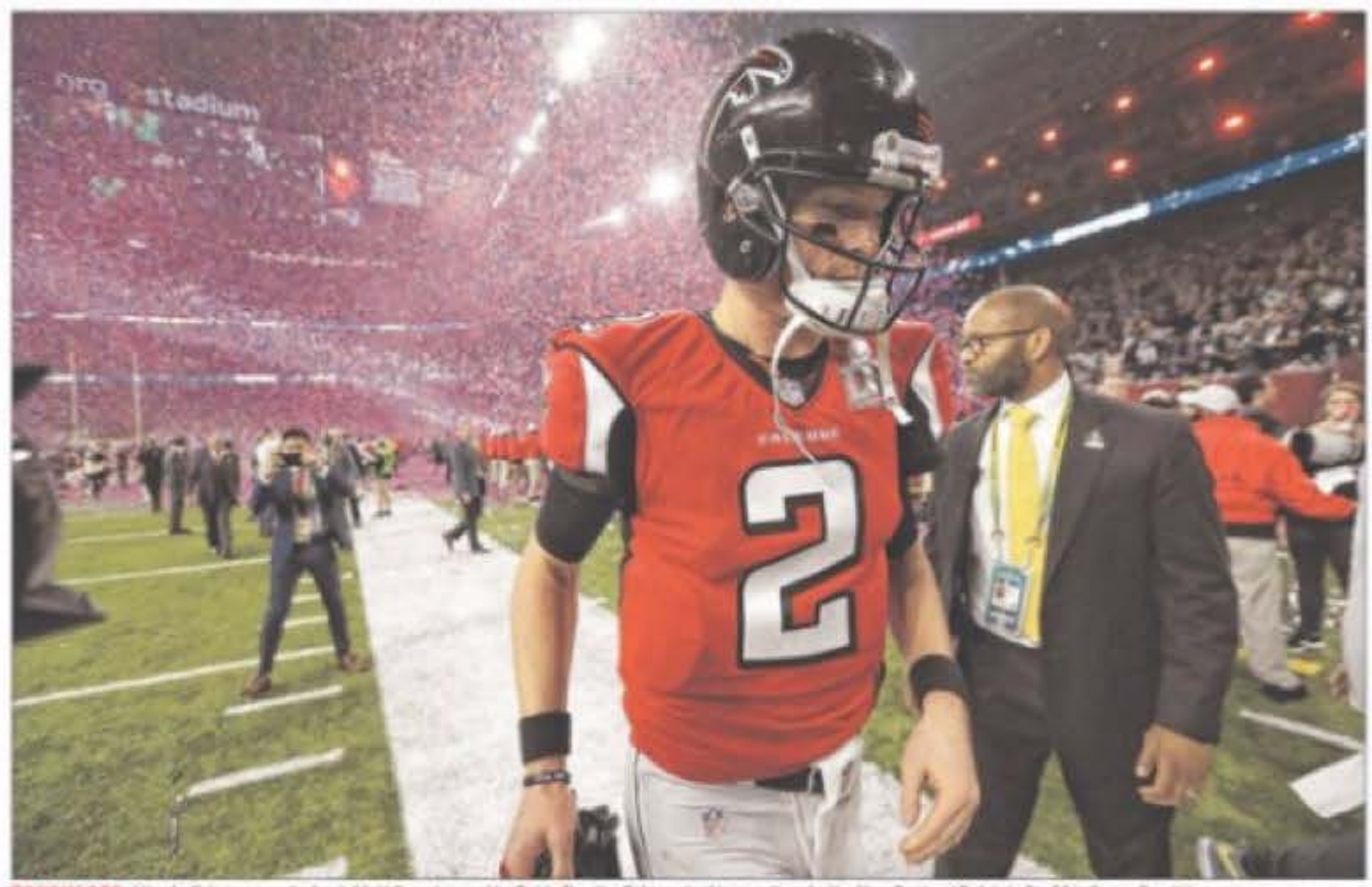
TOUGH LOSS: Atlanta Falcons quarterback Matt Ryan leaves the field after the Falcons lost in overtime to the New England Patriots 34-28 in Super Bowl XLVIII.

From joy to despair: Atlanta watches Super Bowl slip from its grasp.